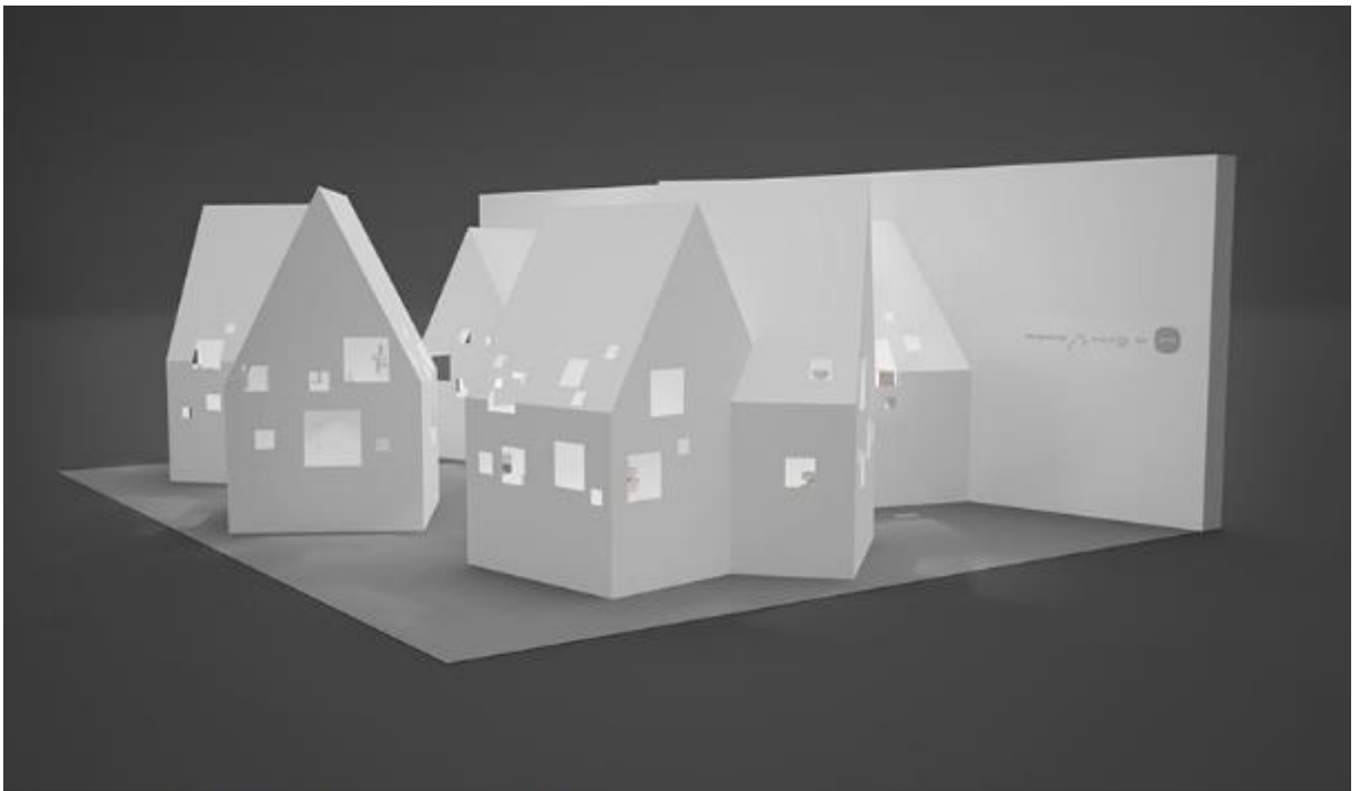
proposal for the installation at maison et objet