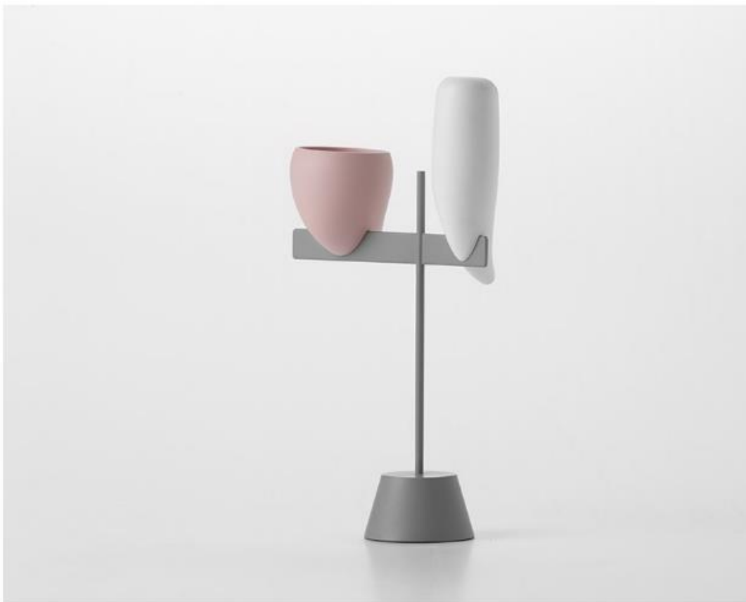
the stands showcase single flower bases and small containers supported by a thin stand