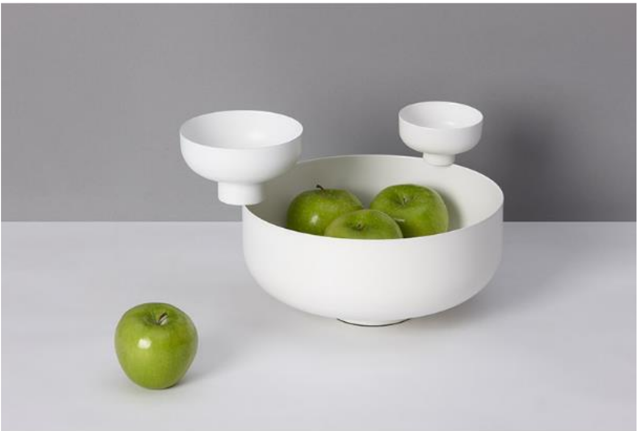
the uses of this pieces can be infinite