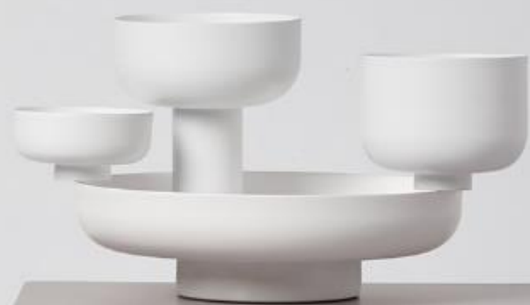
a flat surface serves as a shelf