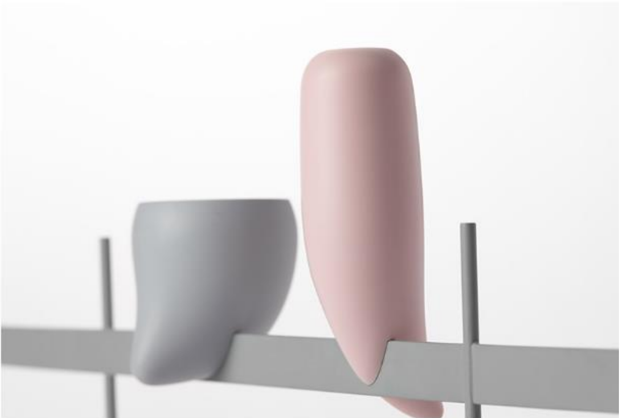
the number of vases can be increased to hold more flowers and reduced when not in need