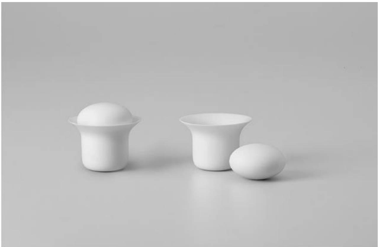
the stone series features a brilliant design motif of smooth stones often depicted in traditional asian paintings