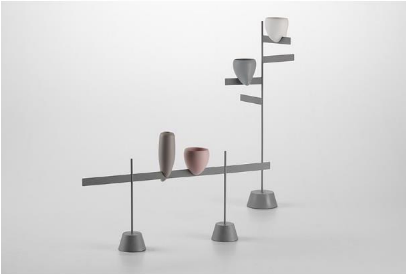
'chirp' takes inspiration from birds resting in electric lines.