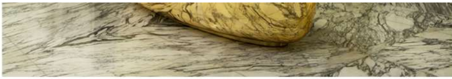
The front desk at the La Clef Champs-Élysées Paris sets a gold standard.