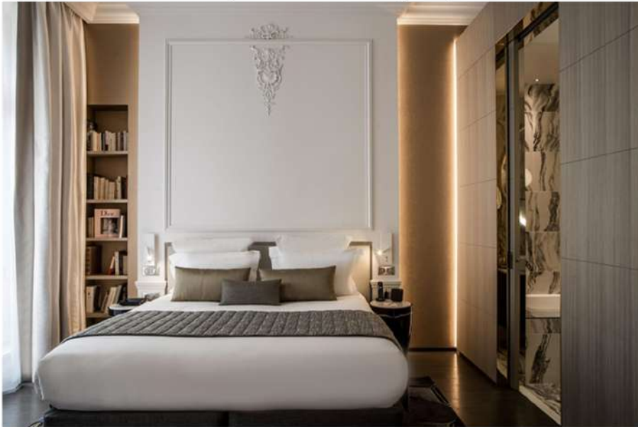
A suite in the La Clef Champs-Élysées hotel which makes use of baroque molding and gold accents for a night of Parisian beauty sleep.