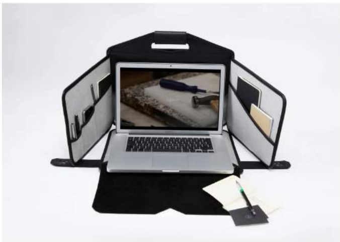
La Fonction's Mobile Workstation

The French leather goods' inaugural design disguises a fully-equipped mobile workstation beneath a suave leather satchel. Reinventing the travelling office, La Fonction is a modestly-sized business, where each model is produced as if it were unique.