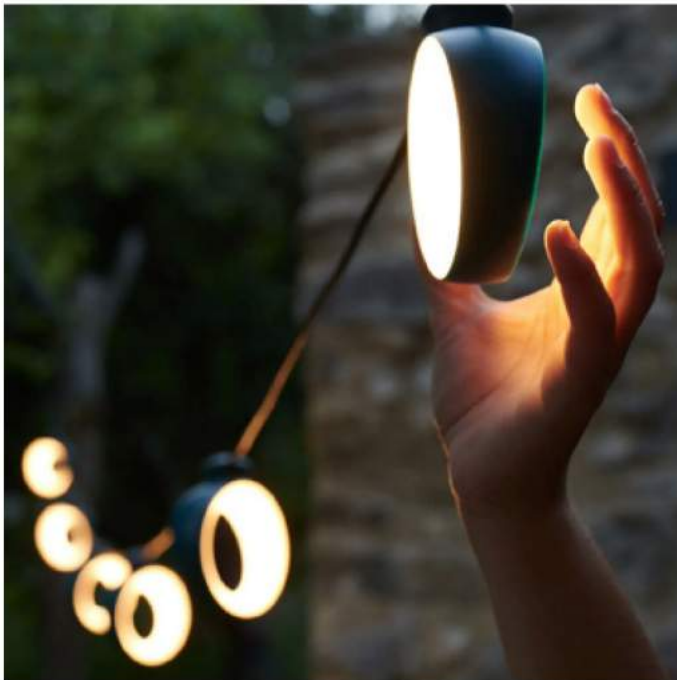
Fermob's Hoop Garland

Undoubtedly, lounging in our balconies and lawns kept us going through the most daunting days of the lockdown. That's precisely why the versatility of the Hoop LED light garland by Fermob is a convenient way to comfortably illuminate any outdoor area within your private space. The 12.20m light garland with 8 rings is loaded via USB. In addition to manual control, it can also be controlled using Fermob's lighting app.