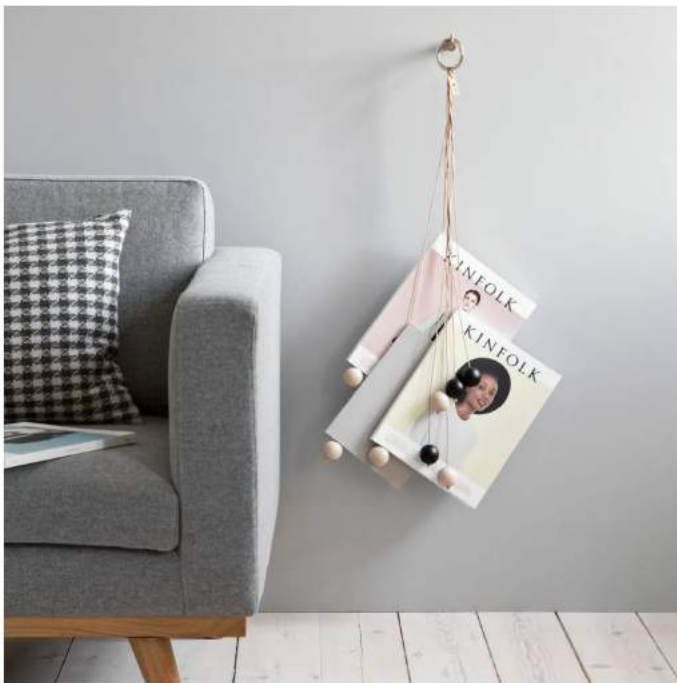
By Wirth's Magazine Hangout