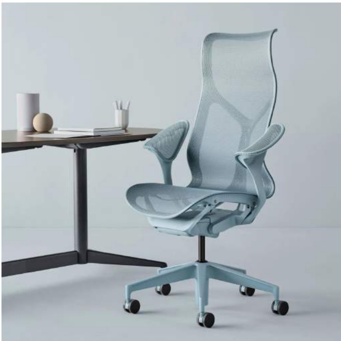
Herman Miller's Cosm chair