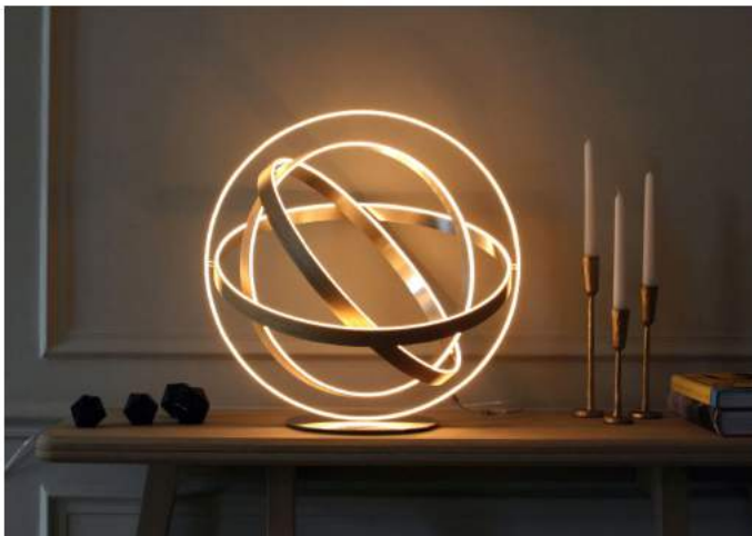
Henri Bursztyn's B612 Lamp

In Antoine de Saint-Exupéry's classic novella 'The Little Prince,' B 612 is conceptualised as an asteroid that has two active volcanoes, an extinct volcano and a rose. Drawing inspiration from the fictional celestial body, the architectural lighting label's B612 creates visual magic through the mastery of invisible LED technology. Inspired by an armillary sphere, four independent adjustable rings offer an infinite diversity of lighting angles.