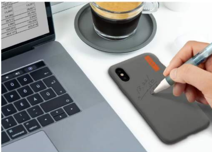
Wemo Coque's iPhone cover

Has the touchscreen made writing obsolete? Maybe not. Combine the best of both worlds with Wemo Coque's case type built for the iPhone 7, 8, and SE2. The silicon phone case not only protects your device, but allows you to take notes externally. Write directly on the case with any oil based ballpoint pen, and erase with the rub of a finger or eraser for convenient reuse.