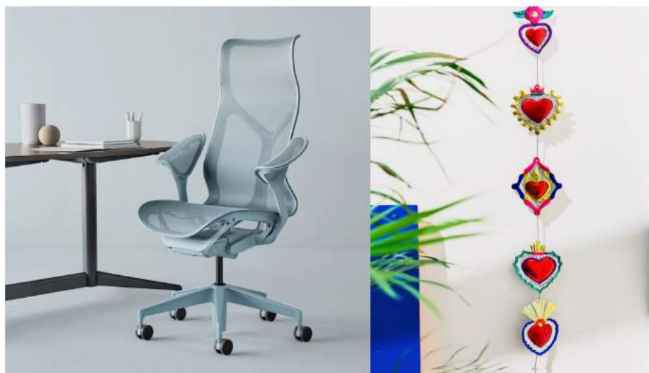
Maison&Objet goes digital this year. Here are our top product picks from the design fair

Paris’ premier design festival, Maison&Objet, has established itself as one the top bi-annual interior decoration trade events not just in Europe but across the globe, since its inception in 2012. With France still in lockdown, M&O decided to run its 2021 spring edition in a new format called Digital Days—launching a new theme online every week till March 2021—every Wednesday, Thursday and Friday.